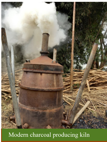
Modern charcoal producing kiln

Traditional earth kiln is the most common used method where wood is arranged on the ground, covered with