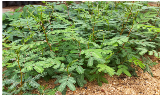
Drought tolerant Acacia tortilis seedlings at KEFRI Kitui tree nursery where they are raised enmass for planting in drylands

For the dryland areas, seedling raising in the nurseries should commence from February to March depending on species types.