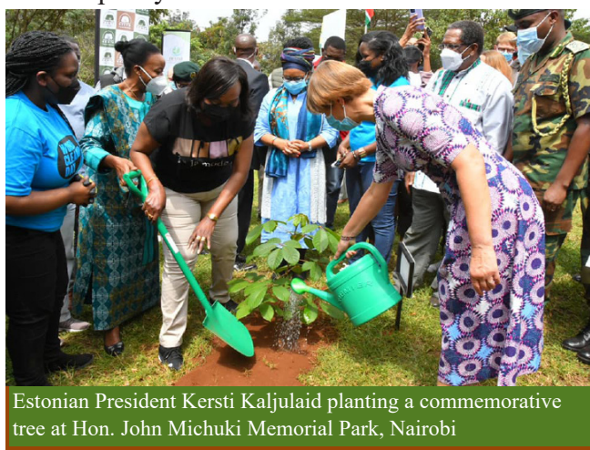
Estonian President Kersti Kaljulaid planting a commemorative tree at Hon. John Michuki Memorial Park, Nairobi

In the arrangement, KEFRI and Gatsby Africa will be providing technologies for species site matching and elite tree germplasm for high productivity and quality products. During her visit, the Estonian President Mrs Kersti Kaljulaid also toured John Michuki Memorial Park where she planted a Meru Oak ( Vitex keniensis ) to commemorate her visit to Kenya that coincided with this year’s World Clean-up Day.