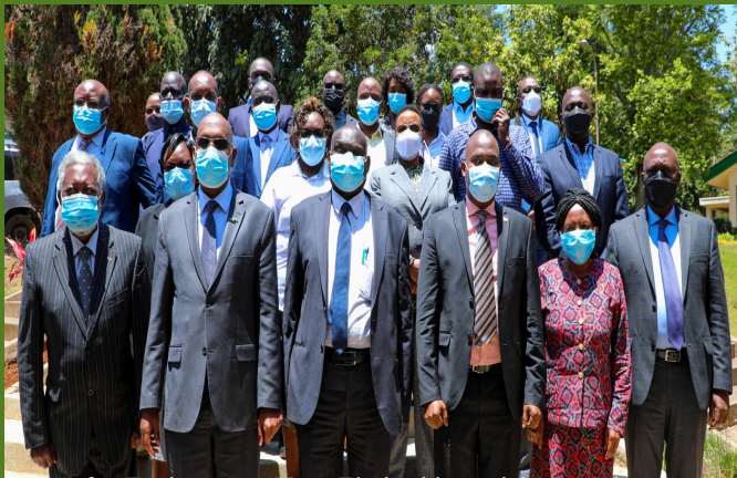
CAS for Environment Hon. Elmi with participants who attended Forest Society of Kenya forestry dialogue conference at KEFRI headquarters