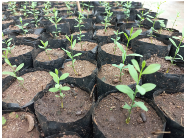
Juvenile Sandalwood seedlings ready for hosting

KEFRI has entered in agreement with several private organizations including Subati Group that are eager to cultivate and process Sandalwood products in the country.