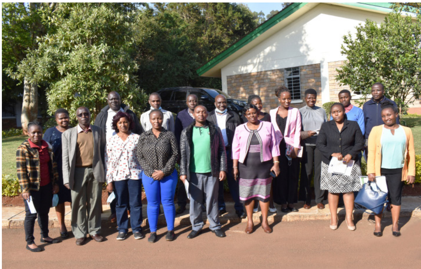
Technicians and facilitators that attended the training course which will eventually lead to better service provision and contribution to the attainment of ten percent tree cover anticipated by 2022